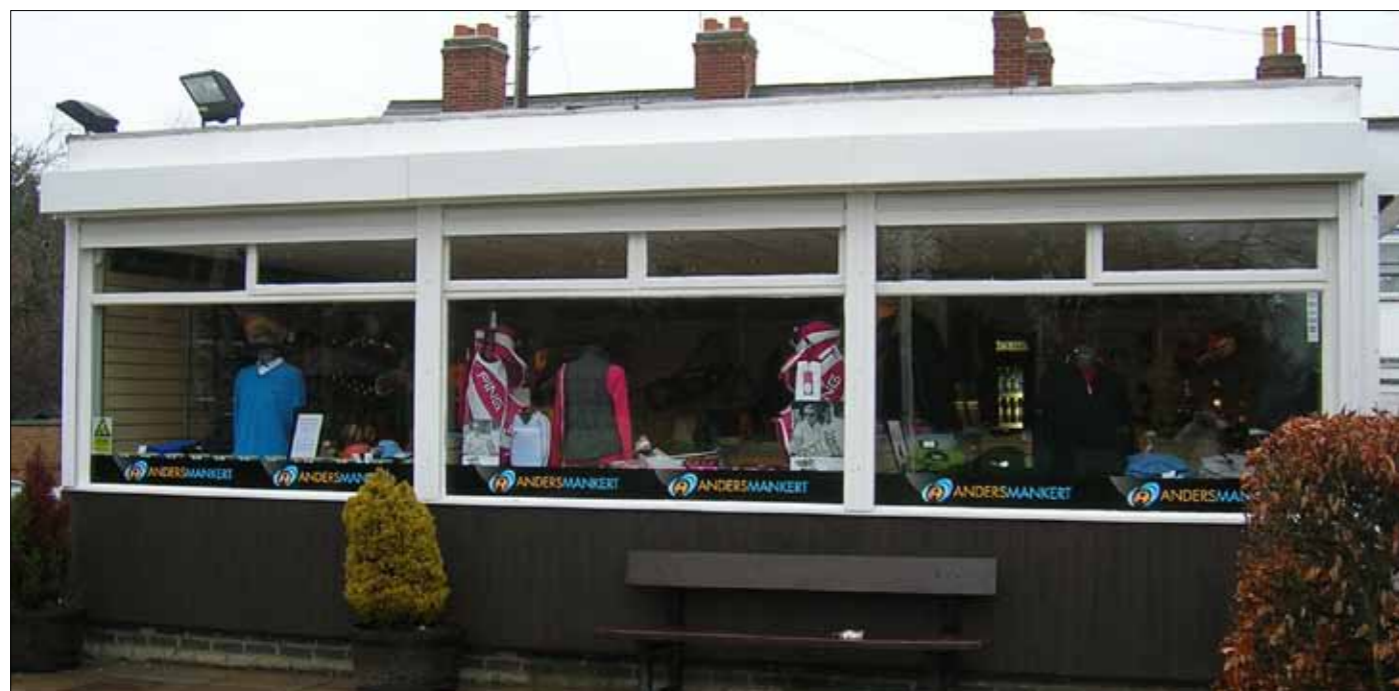
The professional's shop has received a complete makeover and is now warm and welcoming

But what brought Anders to Cosby after spending 17 years coming up through the ranks from an apprentice up to head pro at Kilworth Springs Golf Club on the southern edge of the county?