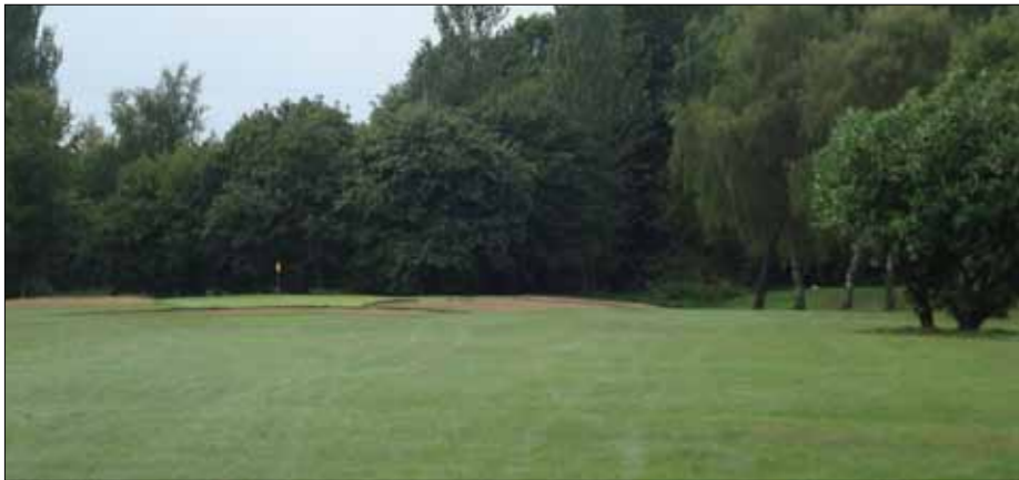
Bunkers combine to create a tricky approach shot to the third green at Western Park