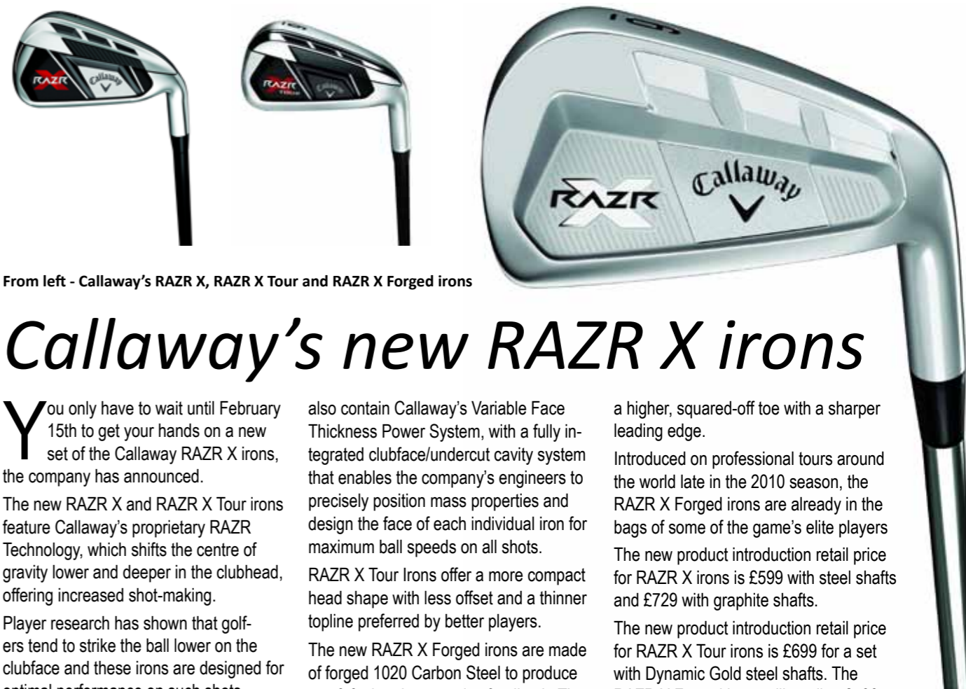
From left - Callaway's RAZR X, RAZR X Tour and RAZR X Forged irons