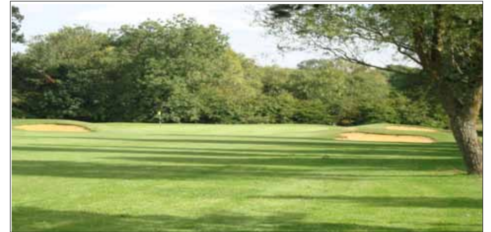
There's plenty of sand in evidence again as you approach the fifth at Humberstone Heights

"Council-owned facilities are an integral part of any county's golf courses"