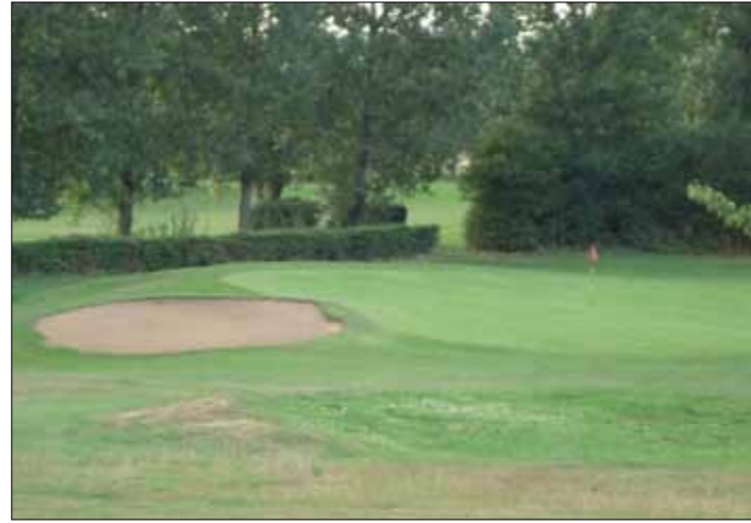
The fairway rises up towards the 11th green at Western Park (above left) before the land falls again down to the green at the 12th hole