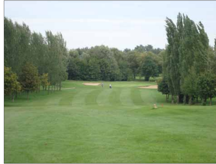
The challenge begins - setting off down the first hole at Humberstone Heights

lined and there is also a lot of sand on the course, both on the fairways and surrounding the greens.