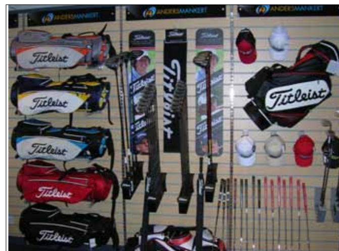
Displays in the refurbished shop include not only Titleist and Ping but Scotty Cameron putters too