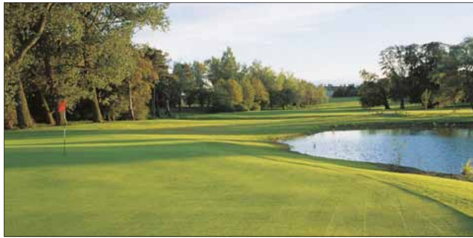
Water eats into the side of the green at Stapleford Park's short but tricky 10th hole