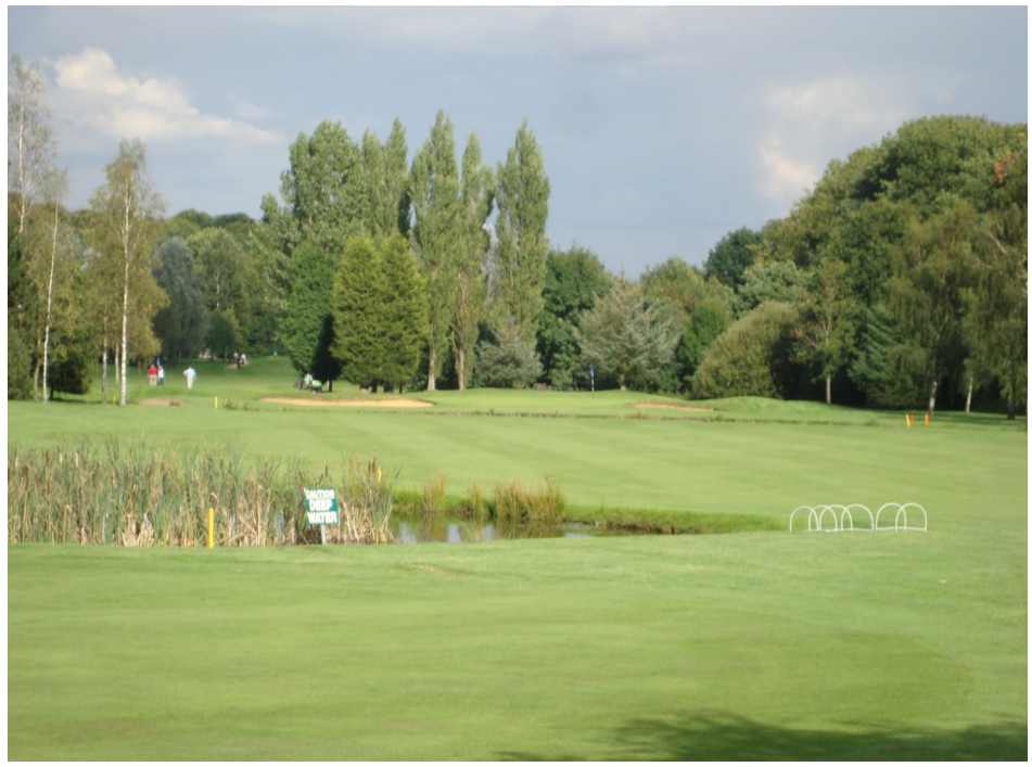
View to the green on the par 5 fourth.

The fifth hole is a par 4 measuring 358 yards from the whites and is a real birdie opportunity. The hole dog legs ever so slightly to the left and you also have water to contend with from your tee shot, the big hitters will take this on leaving a short pitch in, those that play for the gap by the side of the water will still leave a shot in of about 150 - 170 yards to a slightly elevated green which is protected by bunkers.